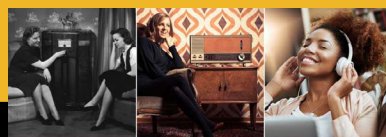
RADIO HISTORY The Evolution of the FM Radio